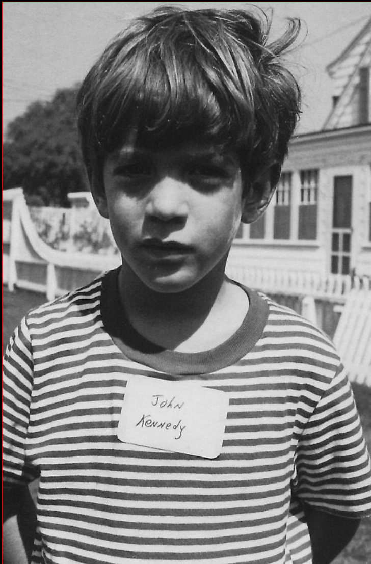
JOHN F. KENNEDY JR. 1960 - 1999