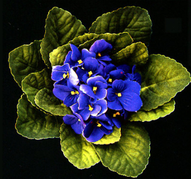
ELIZA DOOLITTLE'S VIOLETS